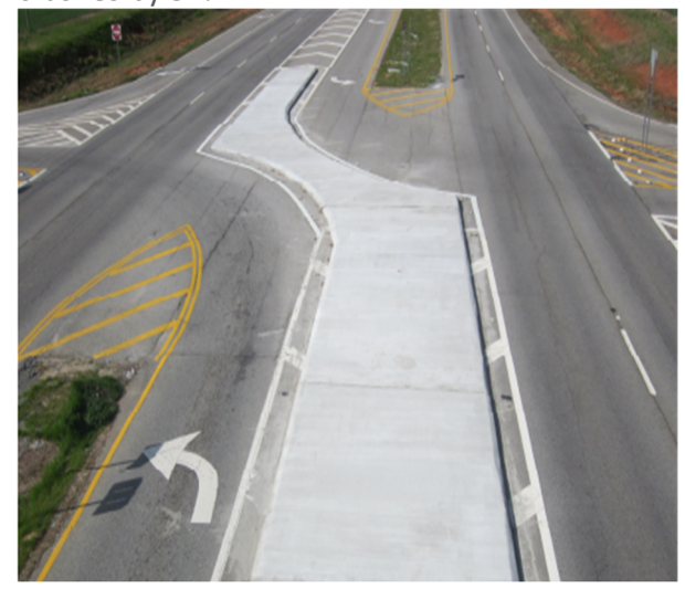
A Reduced Conflict U-Turn (RCUT) intersection example along State Route 20 in Henry County

RCUTs are used to reduce angle crashes by requiring side street traffic to make right-hand turns followed by a U-turn, thus reducing left turn conflicts and preventing a percentage of angle collisions at an intersection. Approximately eight years ago, an RCUT was installed at the intersection of State Route 7 at Grove Street located in the City of Barnesville. At this intersection, angle crashes were reduced by 21% over an 8-year period after the RCUT was placed. Georgia DOT engineers believe similar results can occur with an RCUT at the State Route 7 and Zebulon St./Road intersection in Lamar County. Safety concerns for this intersection include 11 angle crashes, some with severe injuries, counted over a five-year period. Nationally, RCUT intersections reduce crashes by 31%, and reduce severe crashes by 54%.